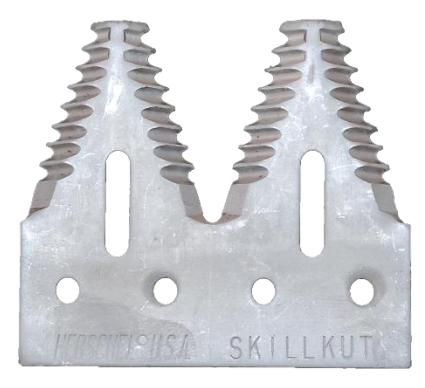
JD (600 SERIES) 8531SK2 $ 2.95 EA.