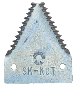
MAC DON 4398SK2 $ 2.00 EA.