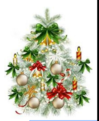
Volume 16 Issue 6 December 2015