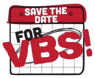
VBS July 11-15