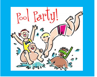
GIFT Pool Party Sat. June 4