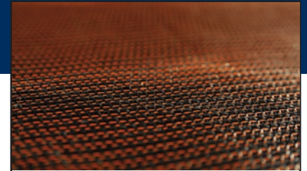
Mirafi® RSi-Series Woven Geosynthetic

Geosynthetic Placement Direct placement of the geosynthetic on the prepared site is usually preferable. Generally, it is advisable to leave vegetative cover such as grass and weeds in place to provide a support matting for construction activities. The geosynthetic should be deployed flat and tight with no wrinkles or folds. The rolls should be oriented as shown on plans to insure the principal strength direction of the material is placed in the correct orientation. Adjacent rolls should be overlapped or seamed as a function of subgrade strength (CBR). Prior to fill placement, Mirafi® RSi-Series geosynthetics should be held in place using suitable means such as pins, piles of soil, etc. to limit movement during fill placement.