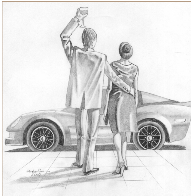
There is nothing wrong with wealth, but when it stands in the way of salvation it can be detrimental for a soul that has died. Rich people often neglect the plan of salvation in lieu of their monetary belongings because they become proud of their ability to make money.

We all understand the pride of many rich people. Their faith is in their possessions and their money. They become lifted up with pride because they feel good about their method of making that money. They usually flaunt it in their cars, homes, clothes and many other things to tell the world that they are wealthy and successful. It is very difficult to get a wealthy man saved for these reasons, and rarely will you ever find a wealthy man waiting for a city bus. The wealthy have become harder to reach. It is a philosophy adopted by the wealthy that there is no God because you are a god