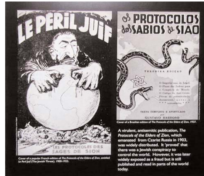
Cover of a popular French edition of The Protocols of the Elders of Zion, entitled Le Peril Juif (The Jewish Threat), 1900-1913.