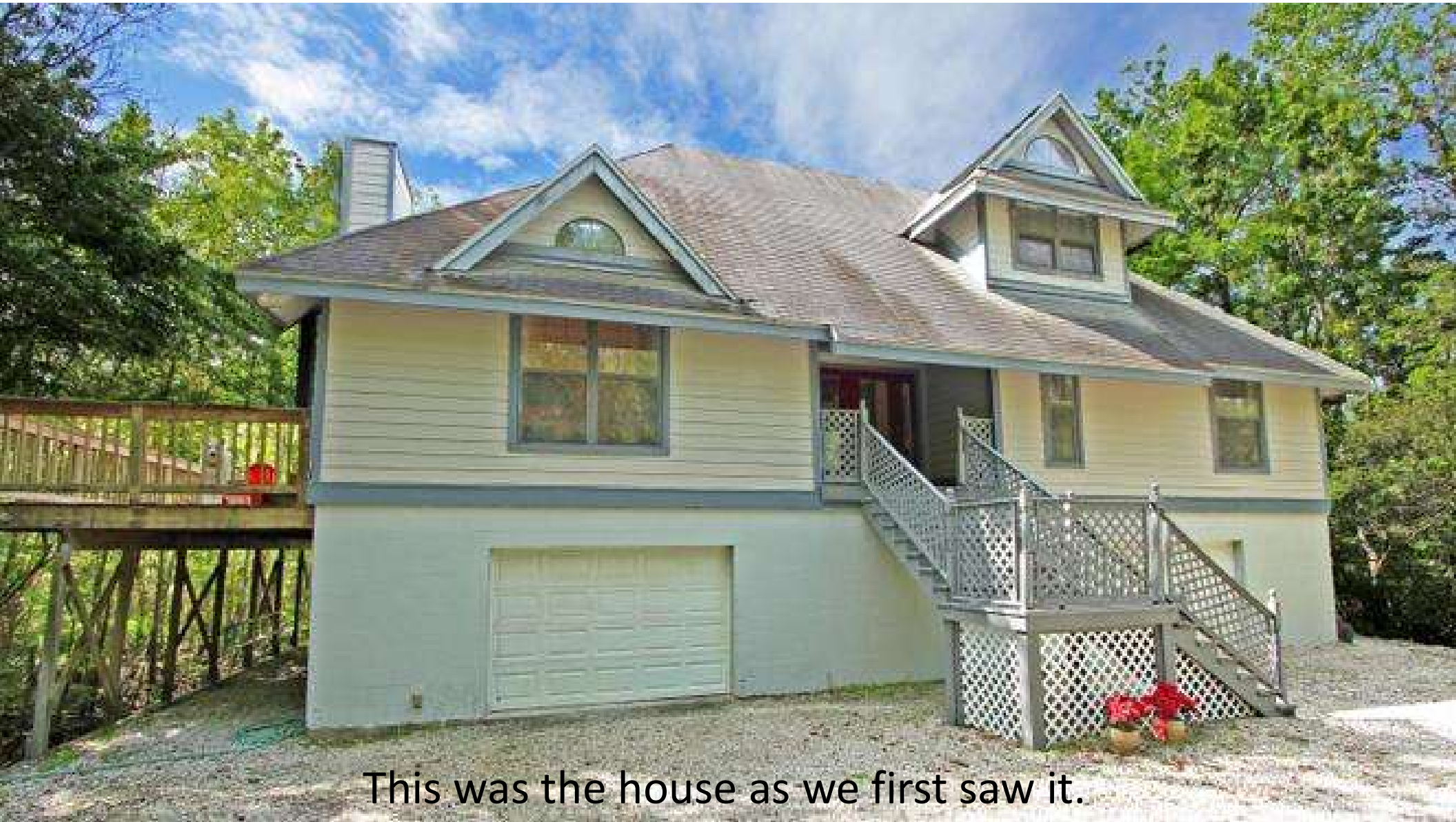
This was the house as we first saw it.