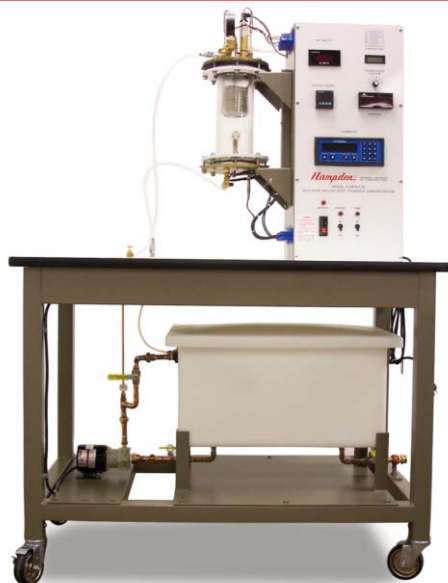
HEAT MASS & TRANSFER