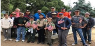
Morgan Hill Scouts help post flags at Gavilan cemetery Memorial Day, above.