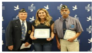
Gavilan College scholarship awards..below