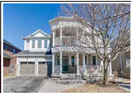
27 Hawstead Cres, Brooklin