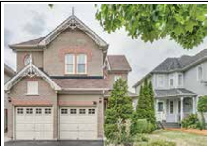
30 Rosemarie Cres, Brooklin