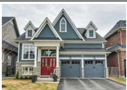
41 Jarrow Cres, Brooklin