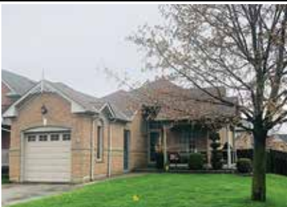
91 St. Thomas St, Brooklin