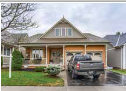
35 Leithridge Cres, Brooklin