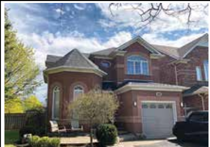
48 Melody Dr, Brooklin