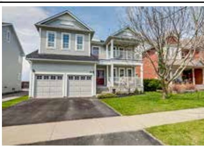
32 Apsley Cres, Brooklin