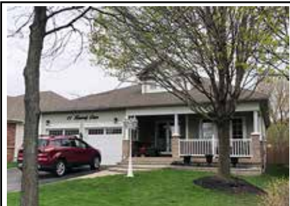
11 Kimberly Dr, Brooklin