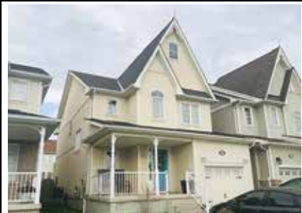
69 Cranborne Cres, Brooklin