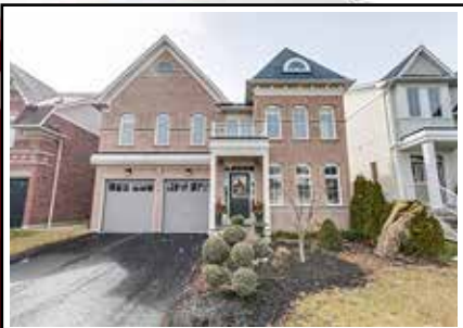
12 Leithridge Cres, Brooklin