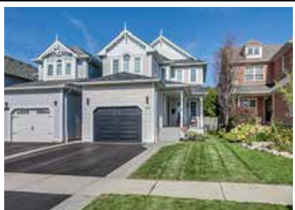
22 Wells Cres, Brooklin