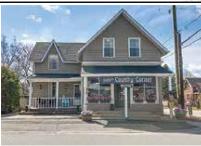
8990 Ashburn Rd, Rural Whitby