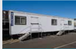
Mobile Offices & Complexes

North America's leader of turnkey modular space and storage solutions