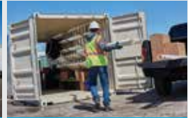
Portable Storage Containers