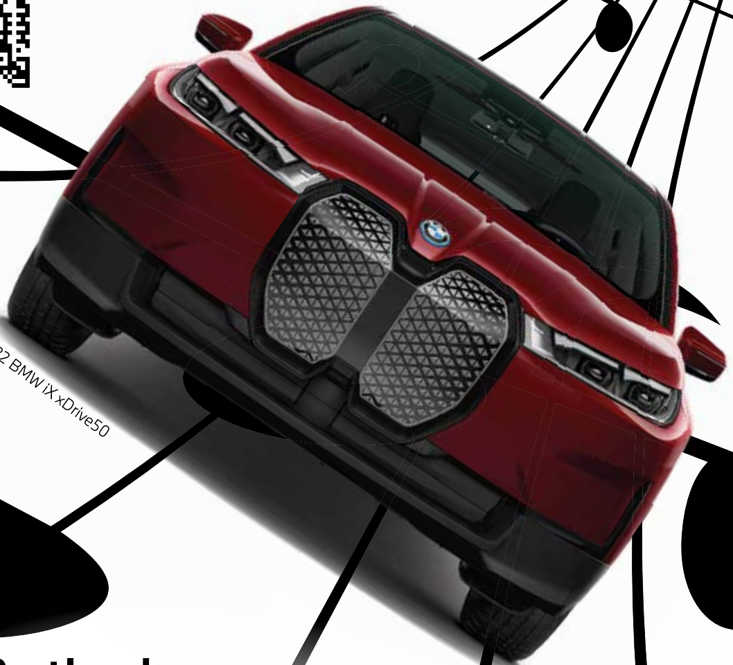
2022 BMW iX xDrive50