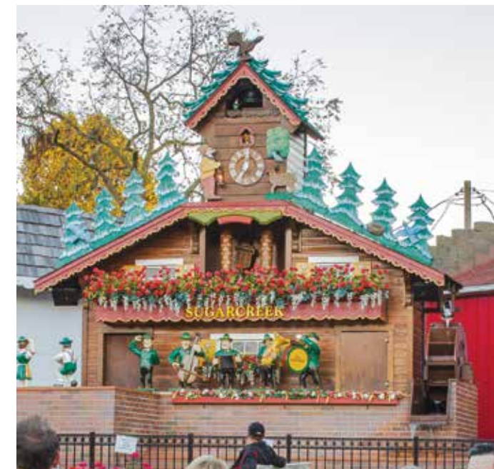
World's Largest Cuckoo Clock