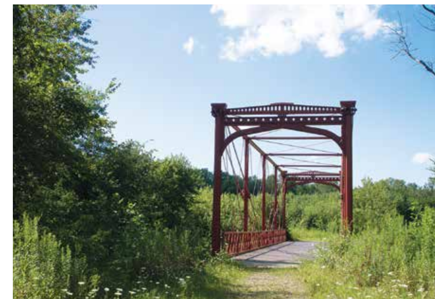
Zoarville Station Bridge