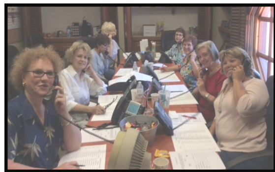
Navajo Canyon ladies working at GOP Headquarters Friday, October 21. We had a great job this time! Calling Republicans that had previously signed up to volunteer.

Almost every person we spoke with signed up to be a precinct captain! We left lots of messages and hopefully they called back and signed up too!!