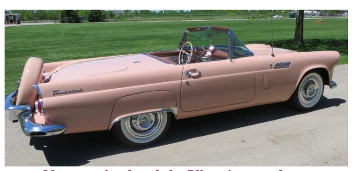
New car in the club -Vince's purchase

Almost new Prestige soft top with swing arm. White vinyl fabric. was down only once. Call Joe, 973-406-4378 or 704-941-5336