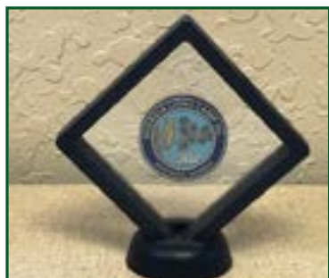
Challenge Coin Front

From May 1 to December 31, 2021 the two Chairmen will match up to $5000 total in donations to the CHALLENGE. As we did last fall, it must be on a personal check, marked CHAIRMAN'S CHALLENGE in the memo field and must be postmarked by December 31, 2021. If you prefer not to write a check, you can use PayPal which is available on the Georgia Lions Camp website which is www.glcb.org .