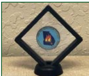
Challenge Coin Back

Again, any donation amount is appreciated but this time we have a CHALLENGE COIN that has the camp logo on the front and Keep the Camp Fires Burning on the back. For a donation of at least $100 you will receive the coin plus a 3D display to place the coin in, if desired. We have included pictures of both sides of the coin in the display in this newsletter.