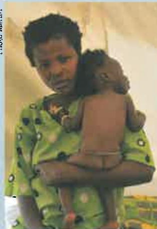
Up to 90,000 refugees are in need of essential health care in DR Congo.