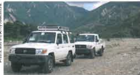
Merlin's mobile clinics are travelling some great distances over difficult terrain to deliver essential health care in Haiti.