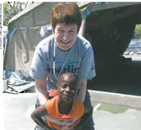
Merlin's emergency hospital treated over 7,000 patients and performed nearly 400 operations.

The team found a safe site for Merlin's tented hospital in the unlikely location of a disused tennis court which affectionately became known as 'Wimbledon'. By the time Wimbledon closed in March, your support meant our surgeons had performed nearly 400 operations, saving lives and limbs.