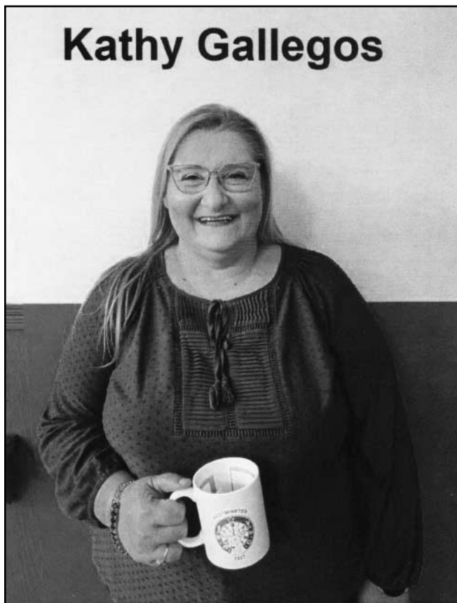
June Elk of Month