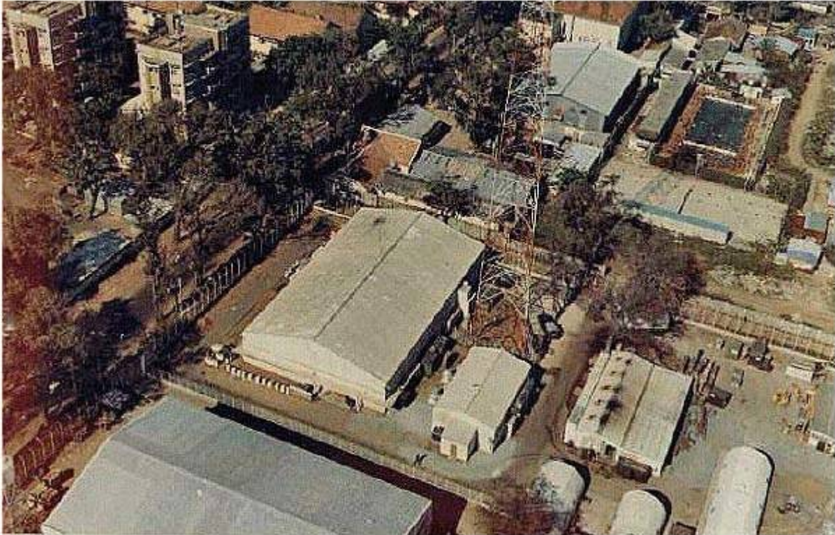
Aerial shot of Headquarters, AFVN, Saigon at #9 Hong Thap Tu.