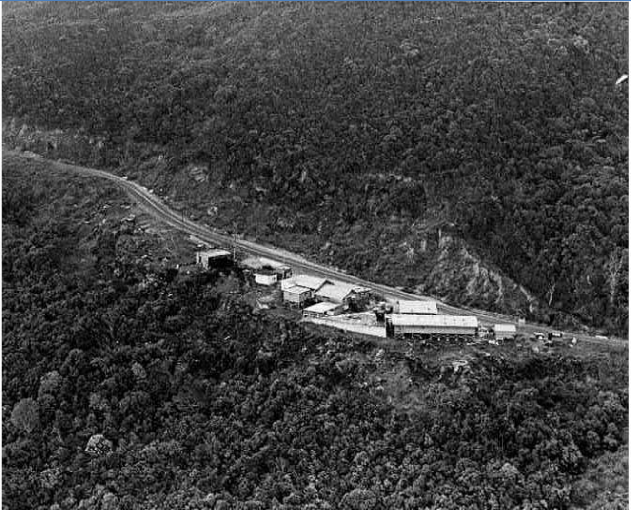
AFVN Det 2, Da Nang, partway up Monkey Mountain.