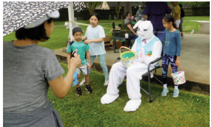
The Easter Bunny taking pictures with children and Moms and Dads