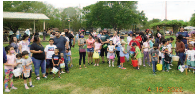
They just kept coming and coming and coming