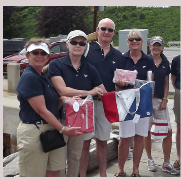
ECYCers modeling some of the new Sailorbags now available at the Ship's Store

The Ship's Store is pleased to present our new Sailorbags