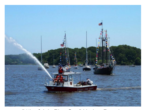
"4th of July Plus One" Harbor Parade