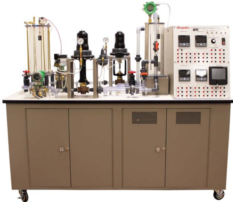
MODEL H-ICS-8189-4 Instrumentation and Control Trainer Dimensions: 75"W x 62"H x 30"D - Shipping Weight: 1175 lbs

In temperature loop, heated water temperature is sensed by a temperature transmitter. Water temperature is controlled by: (1) the voltage applied to the heater coil through the power controller; and (2) whether the water is made to flow through the heat exchanger. A temperature transmitter drives the controller input. The 4-20 mA output loop includes the controller, recorder, and power controller. An additional contact-closure output operates the three-way valve, or the valve may be manually switched to provide the process disturbance.