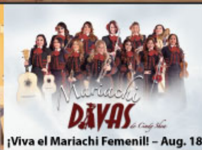
¡Viva el Mariachi Femenil! – Aug. 18