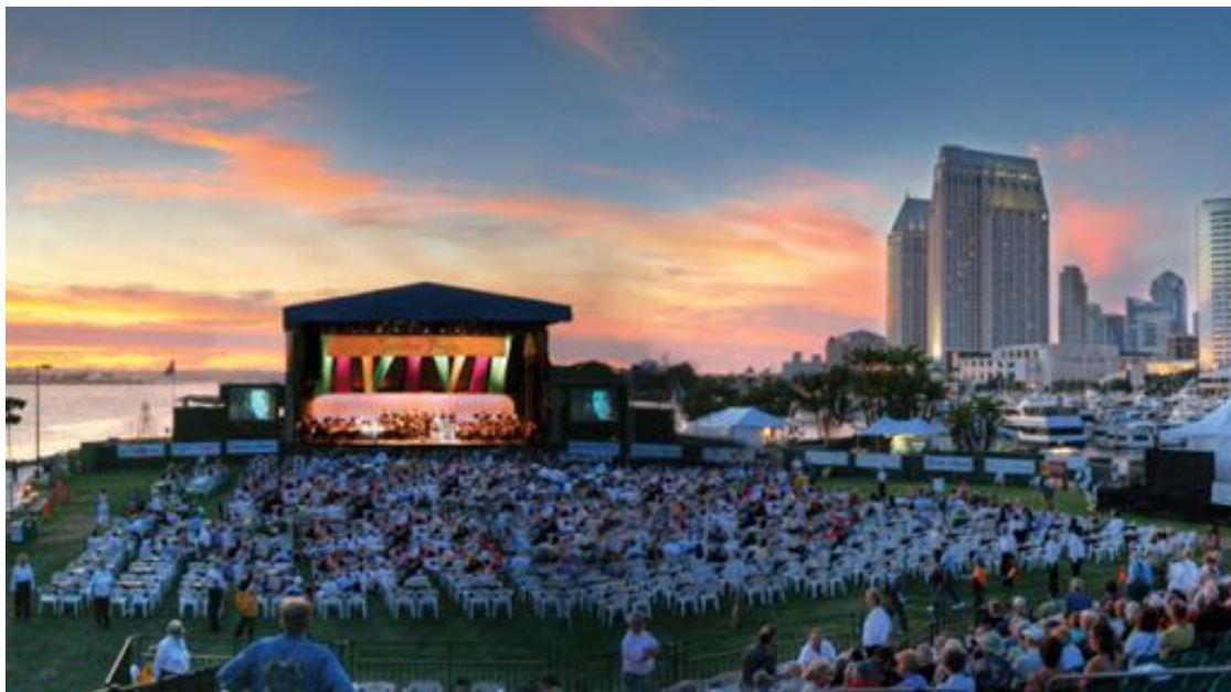
Embarcadero Marina Park South San Diego Symphony Summer Pops Site