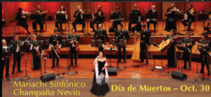
Mariachi Sinfónico Champaña Nevin Día de Muertos – Oct. 30