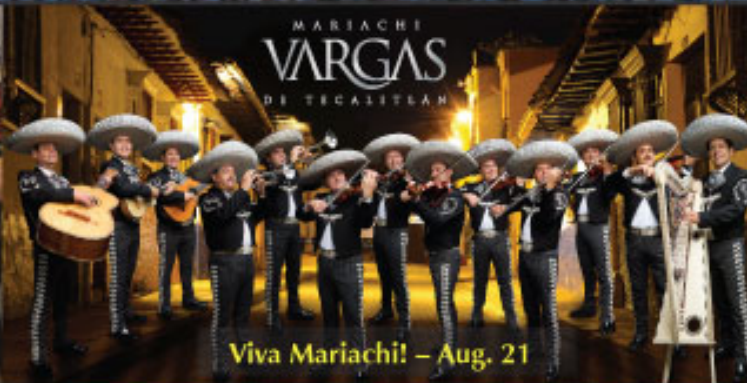
Viva Mariachi! – Aug. 21