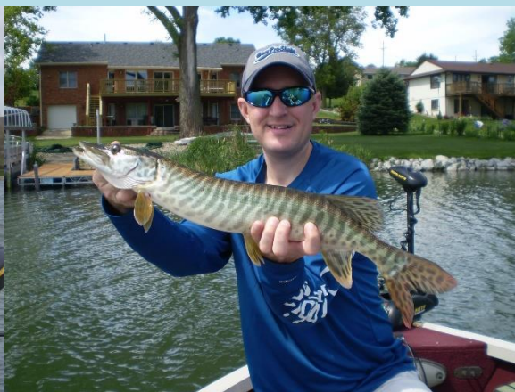
Tiger musky from May 2017 (23 ¼ Inches)