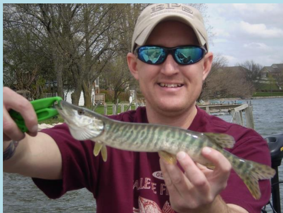
Tiger musky from April 2016 (13 ½ Inches)