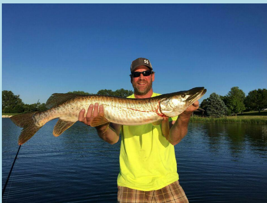
Tiger musky from June 2019 (37 Inches)