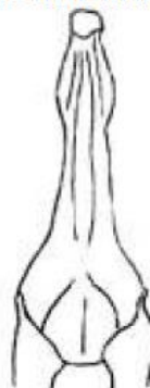
Neck Ventral View