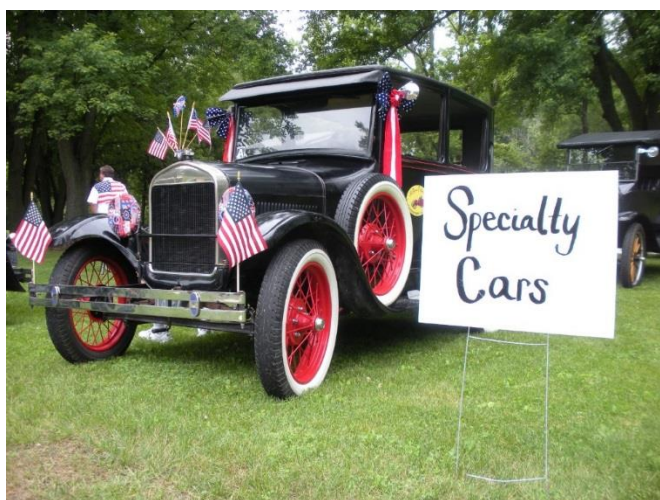
The sign says it all - these cars are pretty special to all of us

seemed bigger than ever with throngs of kids waiting for some sweet treats to get tossed their way. As we wound our way along the route, folks were cheering and waving, especially when you sounded the horn. And after the parade ended, a savory pork chop sandwich awaited us at the city park. What a great way to celebrate America's 248 th birthday!