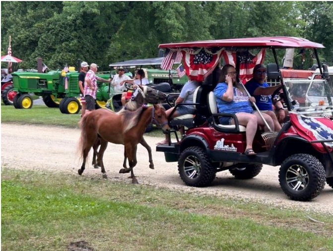
This golf cart had two extra horsepower!