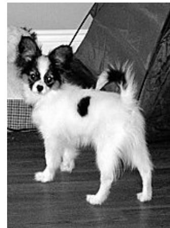
Ricki Abram's new puppy "Kodi"