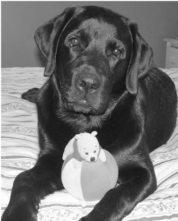
Susan Coutts' Puppy "Tank"