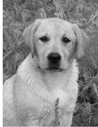
Maryke Warwick's new puppies. "Brogan" at 9 months and "Layla" at 5 months.