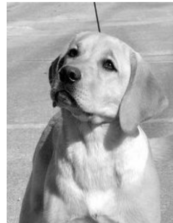
Marie-P Babin's two puppies. "Jorja" & "Frankie" Littermates to "Brogan" & "Tank" 9 months old.