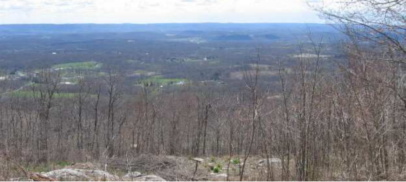
High on the mountain - the trees had not yet budded