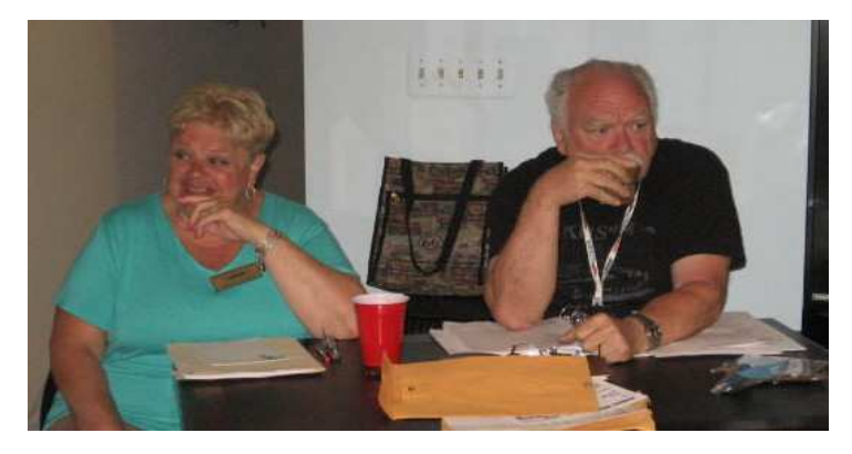
Join CTCI now if you haven't yet. The Early Bird magazine alone is worth the dues.