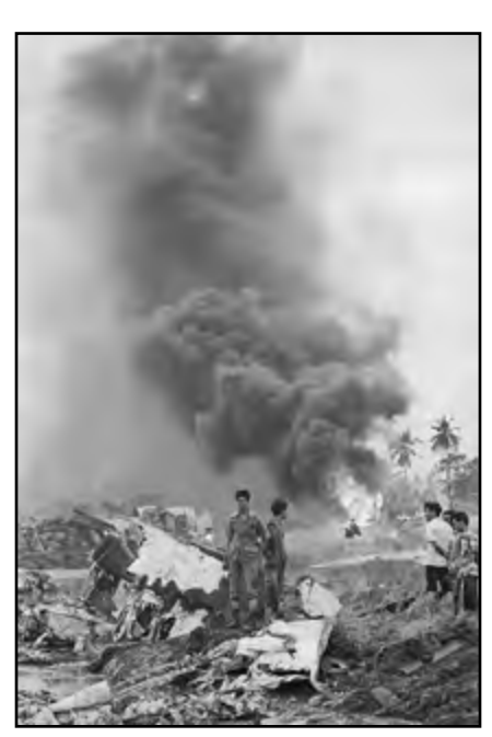
South Vietnamese soldiers standing guard at the site of the crash of the US C-5A transport on 4 April 1975.

The day after the C-5A disaster, I took my wife to lunch at the American Officers' Club to break the news to her that she and our four children must leave the country immediately. She was incredulous. Just that morning she'd gone to a coffee at the