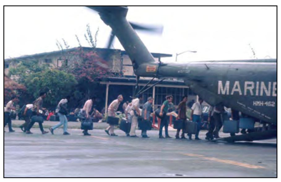
US civilians boarding a Marine Corps CH-53 Sea Stallion helicopter for flight to waiting ships of the 7th Fleet in mid April 1975.