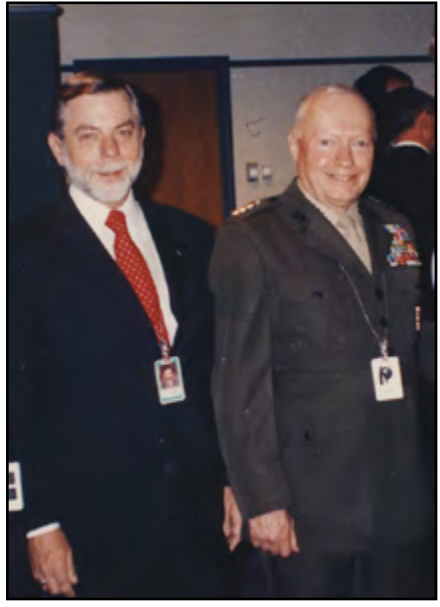
The author with Gen. Al Gray, USMC. Undated photo © author.

Someone found out I spoke Vietnamese and asked me to broadcast a message on a common frequency tell-