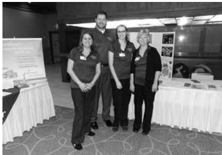
Covenant Digestive Health Center