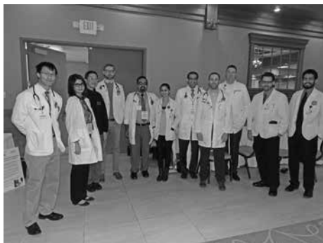
CMU Health Residents and Medical Students