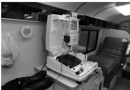
Alyx Component Collection System on the Michigan Blood Bus where one pint equals two