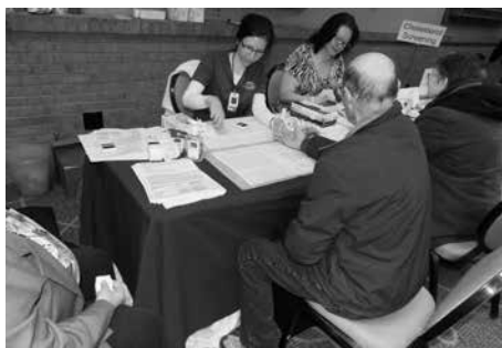
MCVI Cholesterol testing