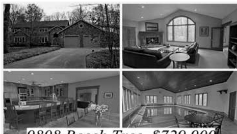
9808 Beech Tree $729,900

6,123 Square Feet Main Living • Indoor Pool ¾ Wooded Acres • Frankenmuth Schools 4 Bedrooms + Office • 3 Full Baths • Heated Floors