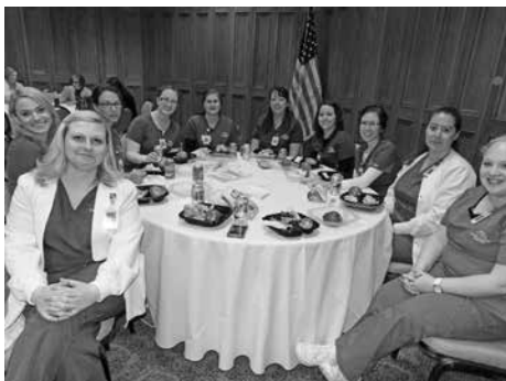
Delta College Nursing Students enjoy lunch after helping at the Health Fair