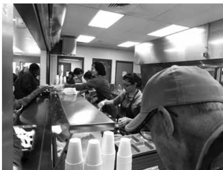
Serving first lunch