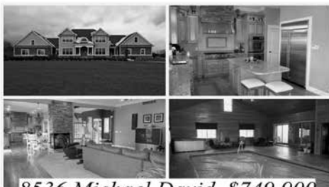
8536 Michael David $749,900

6,123 Square Feet Main Living • Indoor Pool ¾ Wooded Acres • Frankenmuth Schools 4 Bedrooms + Office • 3 Full Baths • Heated Floors