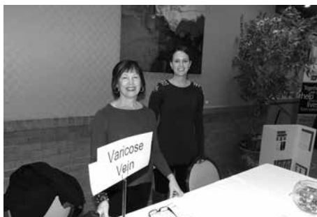
The Vein and Laser Center