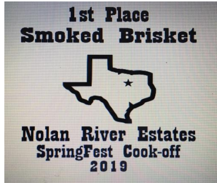
Sean Stotler—1 st Place