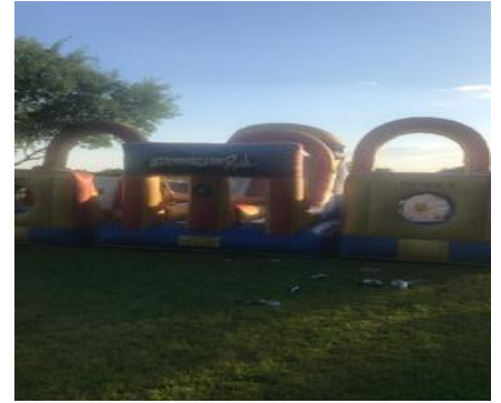
Bounce House/Obstacle Course