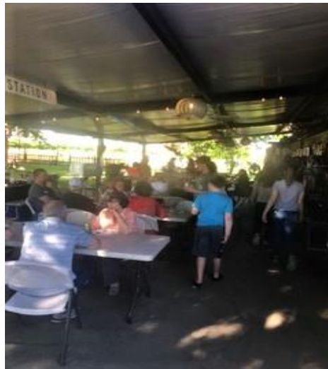
Covered Dining at the Guereca's