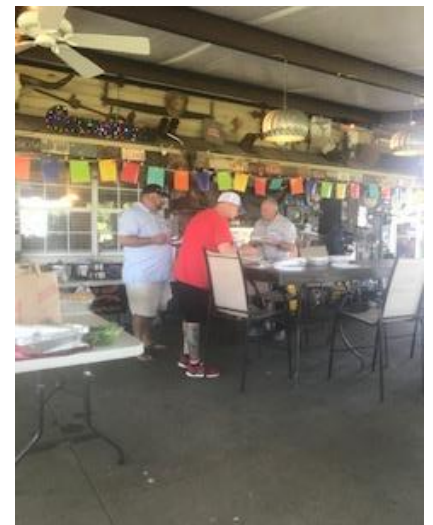
Cook Off Judging