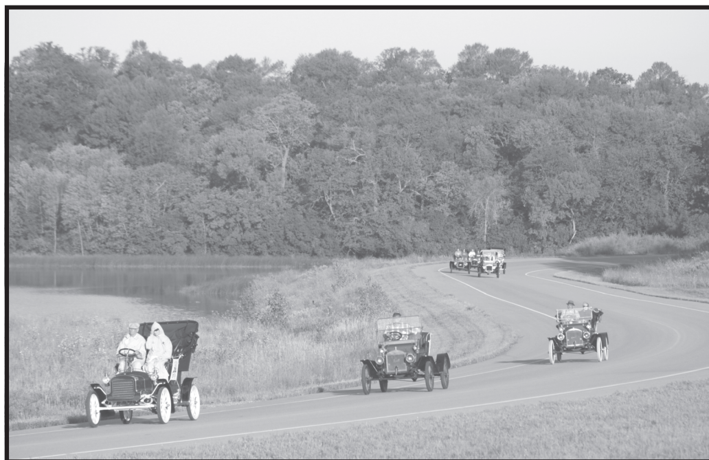
Cars left the New London starting gate at 7:00 am for their 120+ trek to New Brighton on August 14th. They were captured on camera by Jeff Krug, a visitor from Iowa, as they navigated past a pond shortly after the tour began.