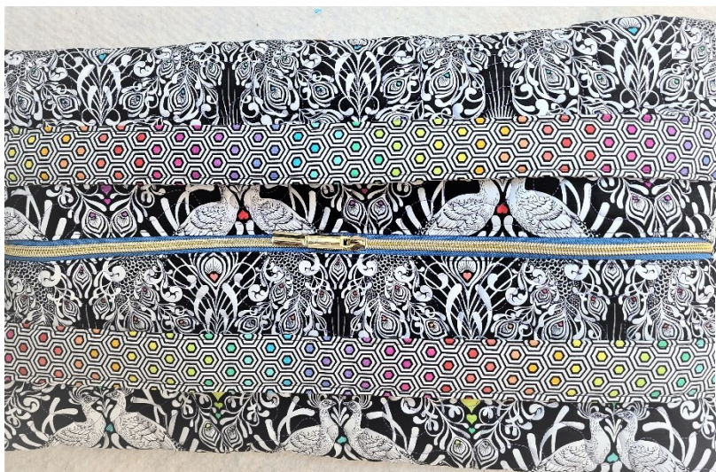
This is a plastic zipper but looks like metal-easy to sew over