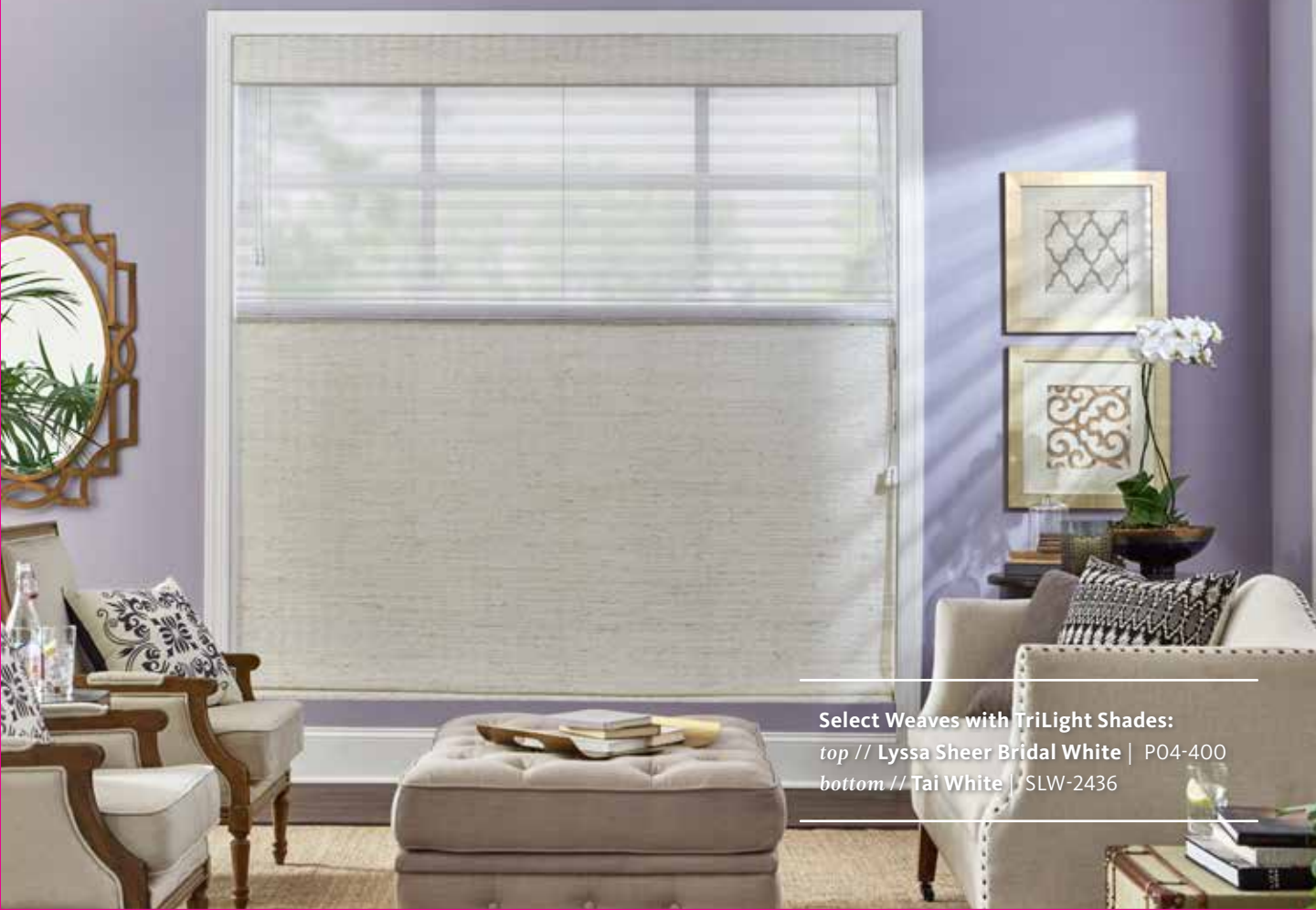
Select Weaves with TriLight Shades: top // Lyssa Sheer Bridal White | P04-400 bottom // Tai White | SLW-2436