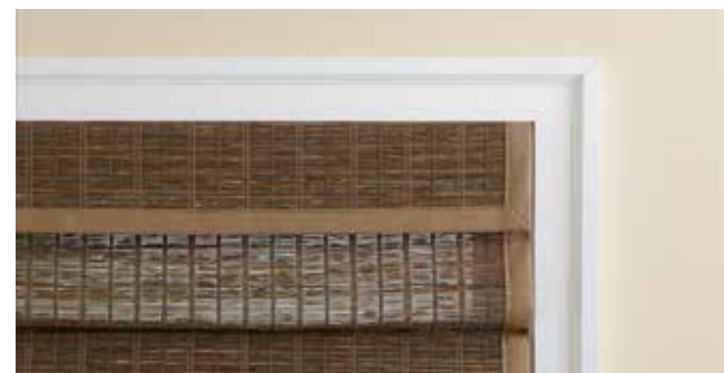
fabric edge binding

A sophisticated accent, faux silk edge binding measures 1" wide with a finished folded edge. Mitered corners lend a custom workroom look. Available on Select and Grass Weaves.