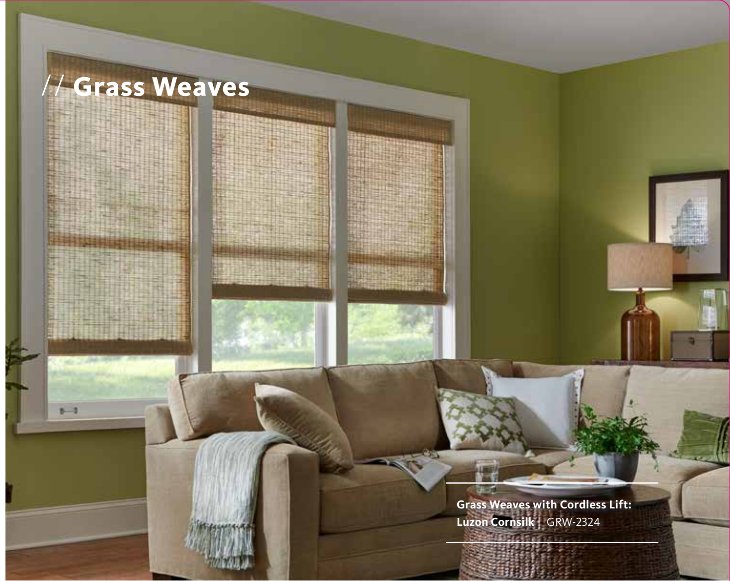
Grass Weaves with Cordless Lift: Luzon Cornsilk | GRW-2324