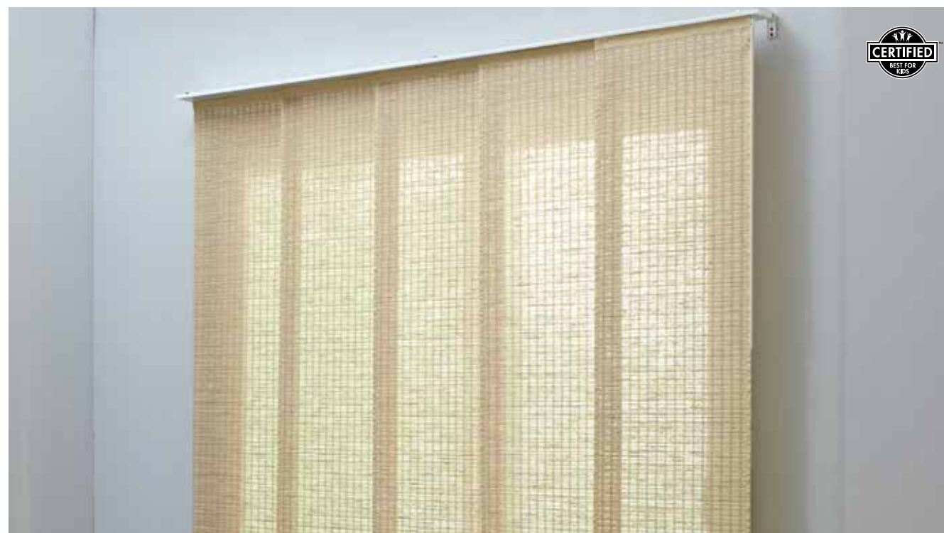
panel track shades

Sections that slide in concert with your door or reach the tallest window in the house with a single length of fabric? We think that's pretty snazzy.