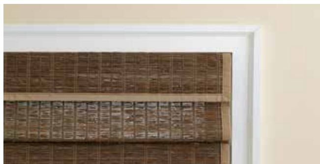
faux silk edge binding

A neat accent, twill edge binding is offered in ⅝" or 1 ½" width with a finished folded edge. Available on all shade styles.