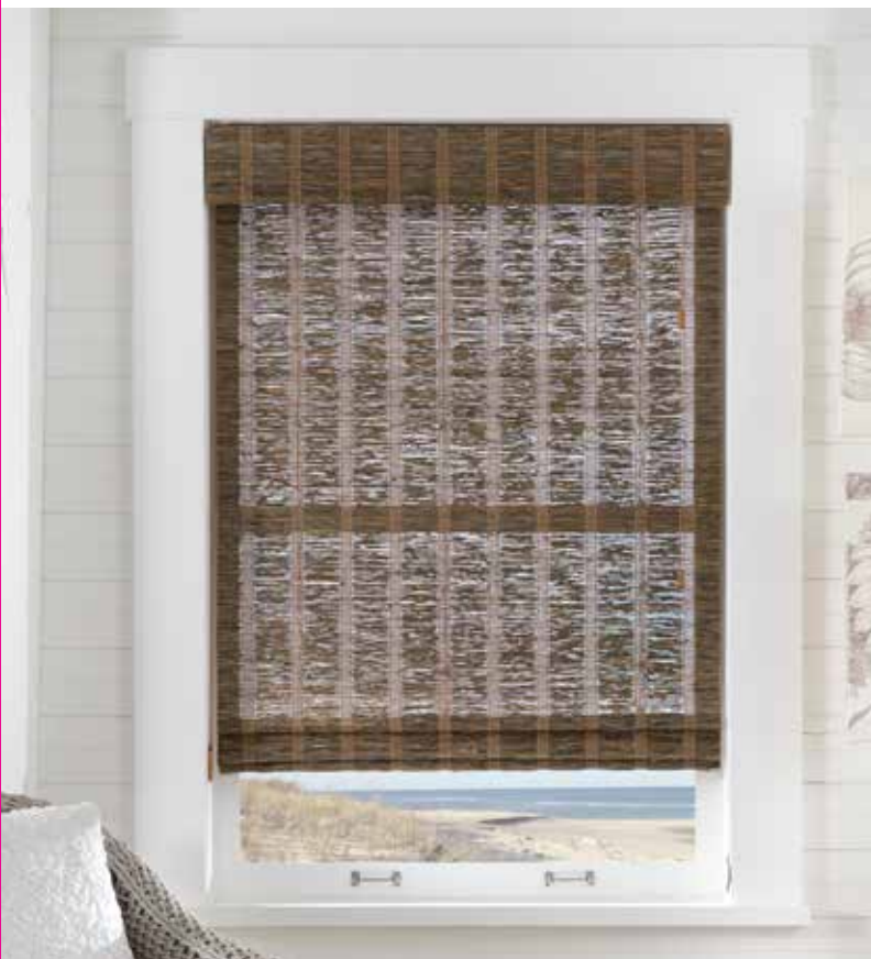
Lower the front shade for diffused light.