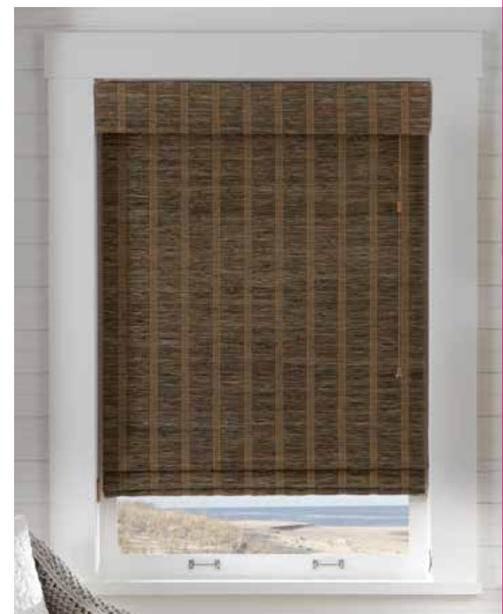
Fully lower the back liner for maximum room darkening (with blackout liner) and privacy.