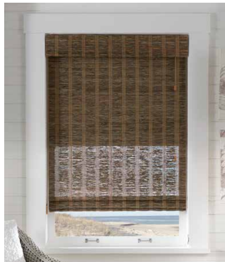
Partially lower the back liner to set the light and privacy you desire.