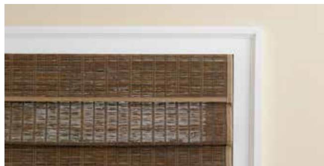
twill edge binding

Add a decorative accent and protect the shade edges by choosing one of three edge binding styles. Our sewn bindings lend durability, structure and a clean appearance.