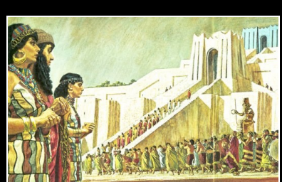
Abram came from a Priestly Family