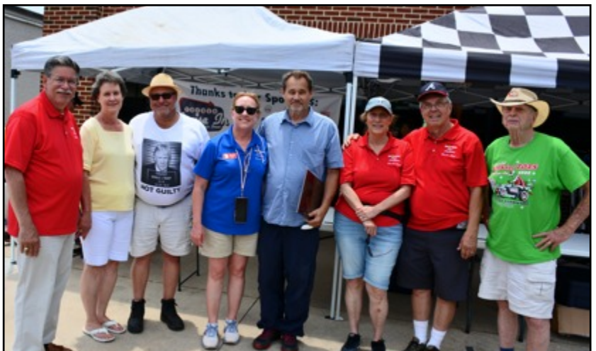
Above: Some of our "Cool Cruisers" that attended the June Cruise-in