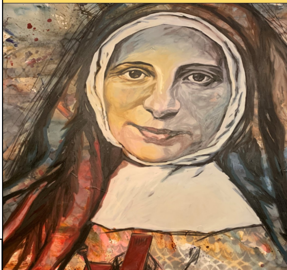
BLESSED FRANCES SCHERVIER FOUNDER OF THE FRANCISCAN SISTERS OF THE POOR