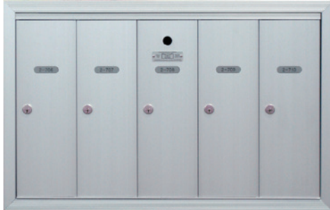
NS101R 5 GANG AL