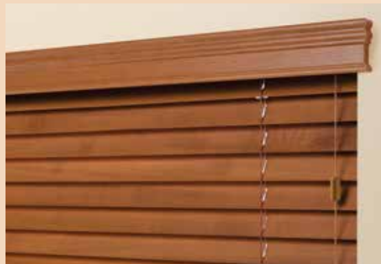
Inside Mount with Returns