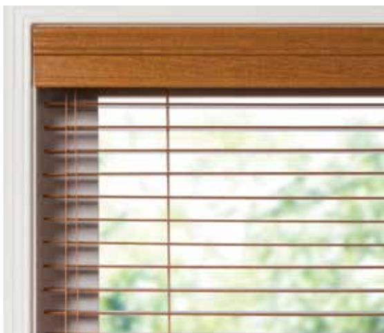
1 3/8" Slat Size

Provides more view-through, with less stack, than 1" blinds.