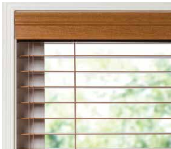
2" Standard Slat Size

Provides more view-through, with less stack, than 1" blinds.