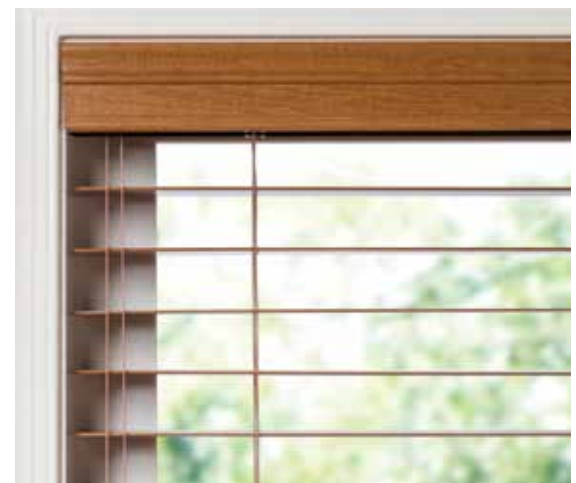
2 3/8" Slat Size

Larger scale offers optimal view-through and a more dramatic look.