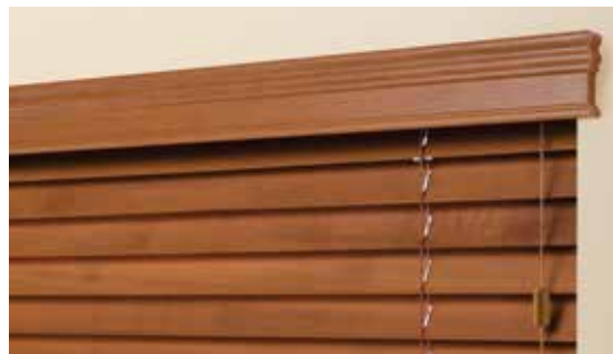
Inside Mount with Returns