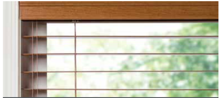
2 1/2" Slat Size

Larger scale offers optimal view-through and a more dramatic look.