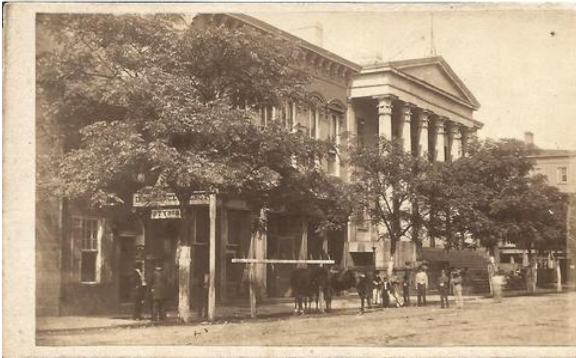
A Bank And Custom House In Savannah

The Whigs victory in 1841 is driven in large part by public anger over the uncertain currency and sluggish economy that has plagued the country since Jackson's "Specie Circular" order and the subsequent Panic of 1837.