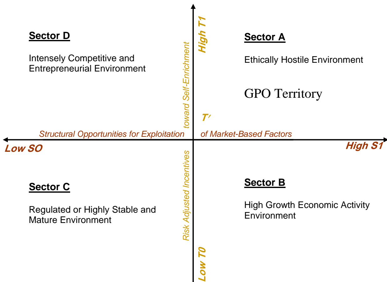
Exhibit 5: Influencing Ethical Conduct In Group Purchasing Organizations

The first dimension, S_0S_1 , of the framework deals with GPOs’ external, market-based environment and opportunities that it provides for the middlemen to maximize agency profits. The second dimension, T_0T_1 , indicates the magnitude of incentives