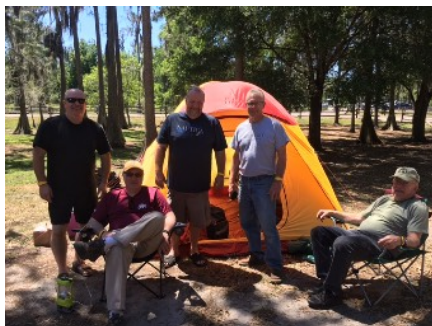
In Fort Wilderness