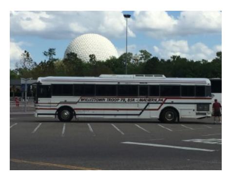
The new Troop bus