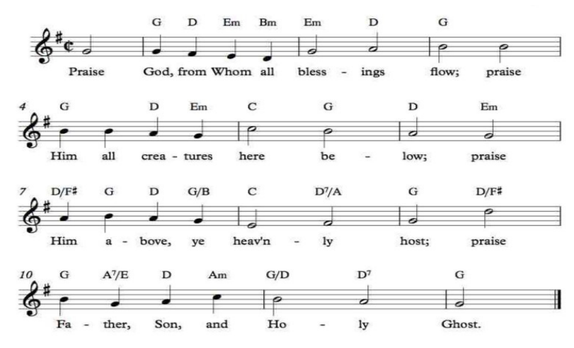
Doxology, written in England for Protestant Churches in 1674.

As the offering is brought forward, we will sing the Doxology.