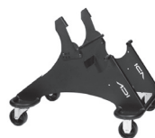
SE-20 A : 22" C : 24"