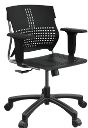
SE-L A : 18" C : 16" - 21" E : 14"