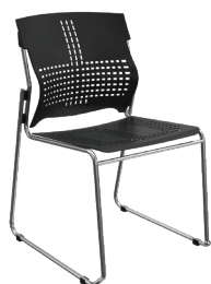
SE-2 A : 18" C : 18" E : 14"