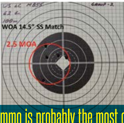
A match-grade barrel shrunk the M855 group (left) by ½ MOA and brought the Black Hills 77Gr. OTM (right) down to 1 MOA, with no flyers.