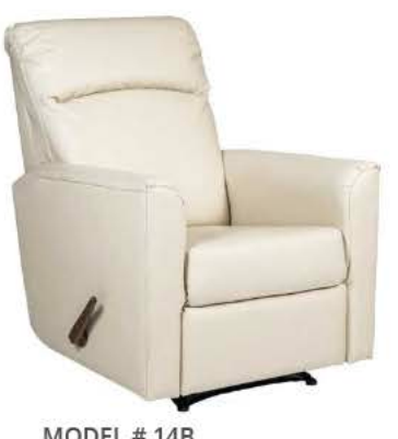
MODEL # 14B 32"W x 36" D x 41" H

Customize your fabrics and finishes. Call for additional models and options. Bariatric models available.