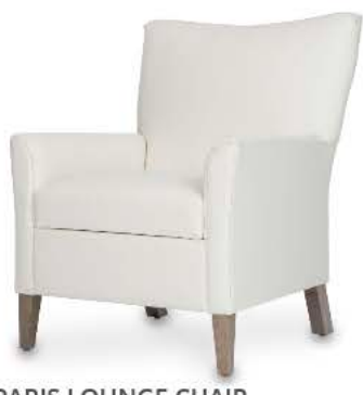
PARIS LOUNGE CHAIR 29"W x 32" D x 38" H (*available in loveseat and sofa)