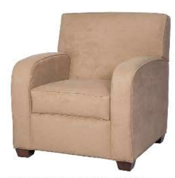
AUGUSTA LOUNGE CHAIR