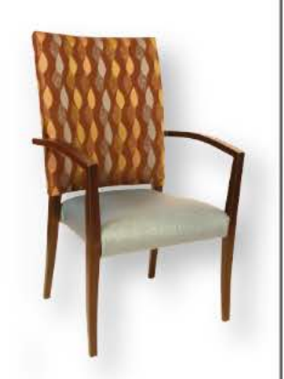
LAVERGNE (S) 24.5"W x 26.75" D x 42" H