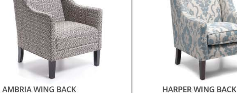
31"W x 30" D x 42" H