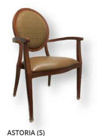
23.75"W x 23.5" D x 37.5" H