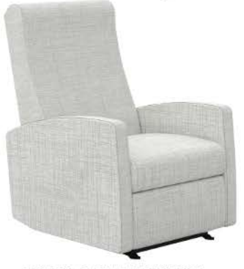
POWER & LIFT RECLINERS 31"W x 34" D x 40" H