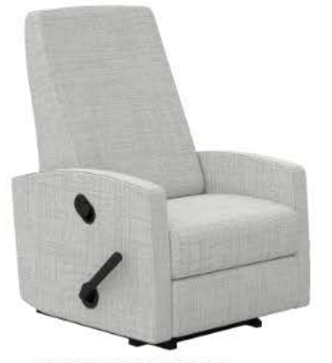
ROCKER RECLINERS 33"W x 34" D x 43" H