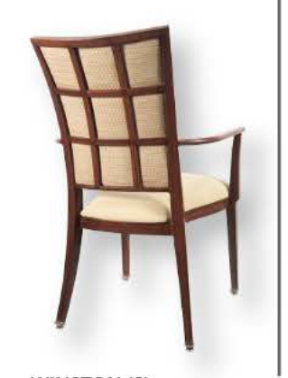
WINSTON (S) 23.5"W x 25" D x 38" H

LEDGEND (S)—STACKS 5 HIGH Ask about Quick Ship Mode starting at $229 EA