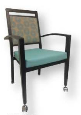
BAXTER (S) 23"W x 23.75" D x 37.5" H