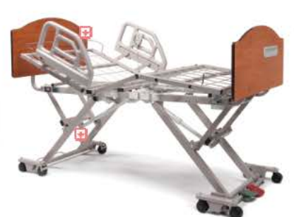
Fits: 35" W x 76-80" L Mattress