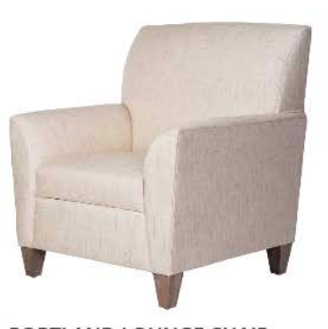
PORTLAND LOUNGE CHAIR 35"W x 32" D x 41" H (*available in loveseat and sofa)