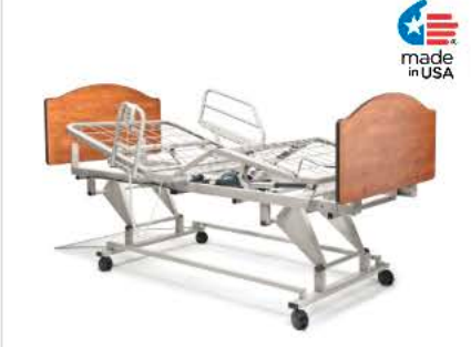
Fits: 35" W x 80" L Mattress