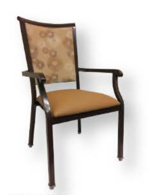
LINCOLN (S) 23"W x 24.5" D x 39" H