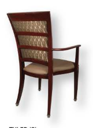
TYLER (S) 24"W x 23.25" D x 38" H