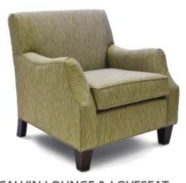
CALVIN LOUNGE & LOVESEAT