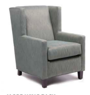
JACOB WING BACK 26.75"W x 33" D x 37.5" H