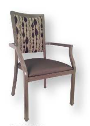
ADAMS (S) 24"W x 24" D x 38" H