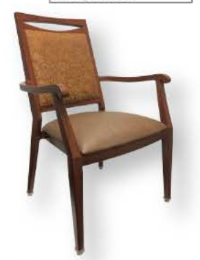
MORGAN (S) 24"W x 24" D x 38.25" H

LEDGEND (S)—STACKS 5 HIGH Ask about Quick Ship Mode starting at $229 EA