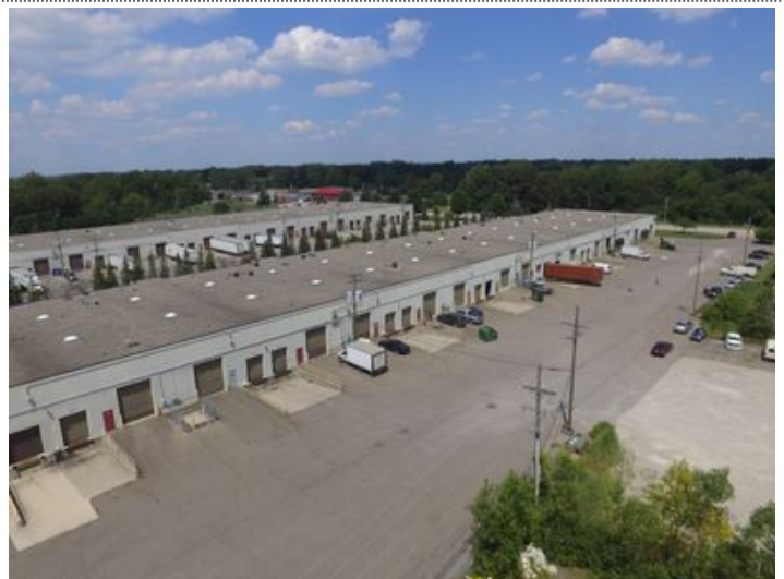
Taylor Trade Center 3 9,600sq.ft