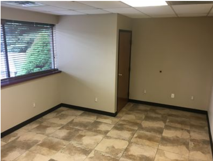
Taylor Trade Center 3 9,600sq.ft