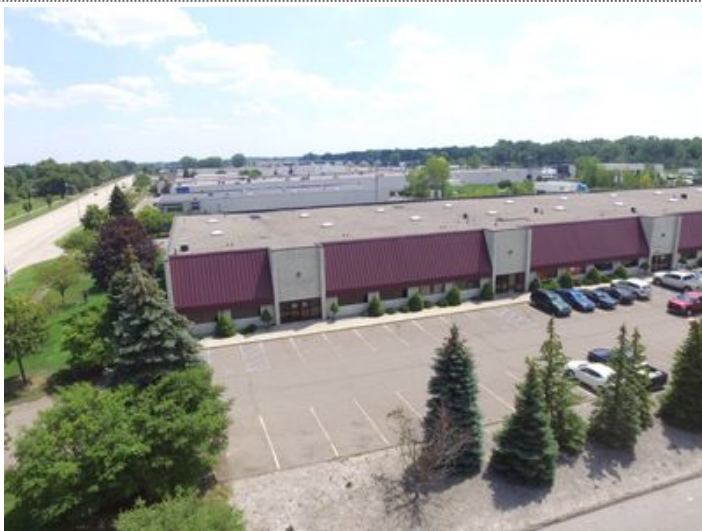
Taylor Trade Center 3 9,600sq.ft