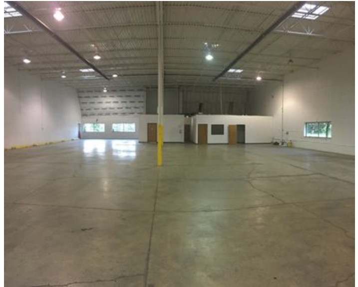
Taylor Trade Center 3 9,600sq.ft