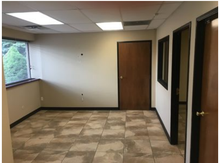
Taylor Trade Center 3 9,600sq.ft