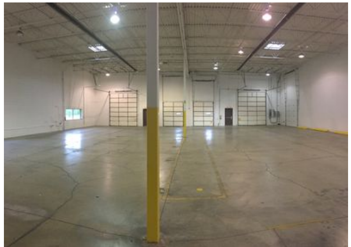
Taylor Trade Center 3 9,600sq.ft