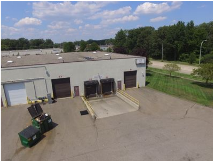
Taylor Trade Center 3 9,600sq.ft. (13)