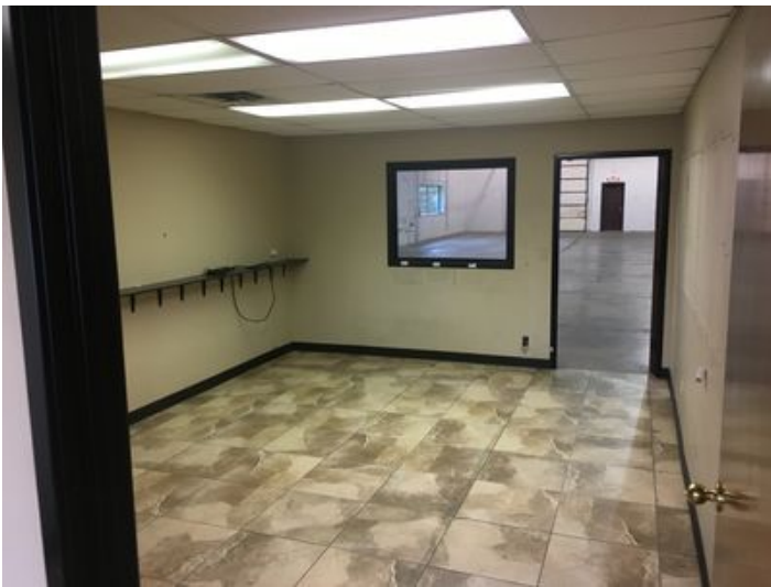
Taylor Trade Center 3 9,600sq.ft