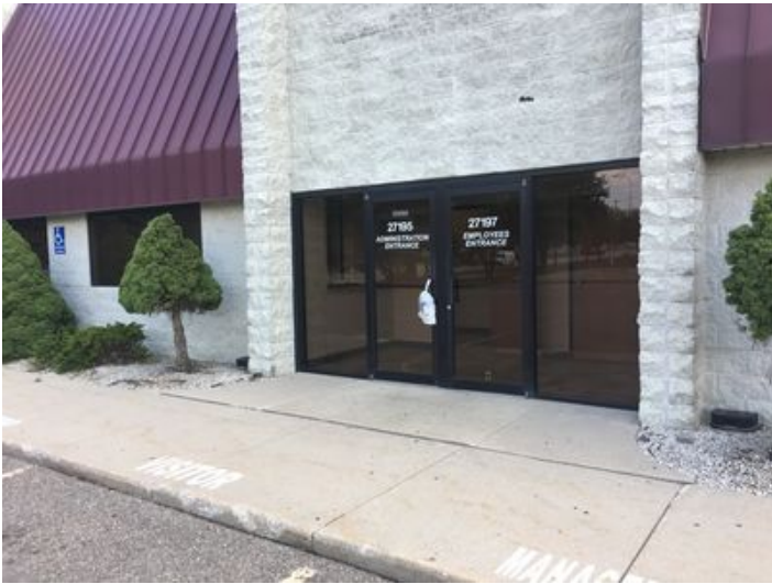
Taylor Trade Center 3 9,600sq.ft