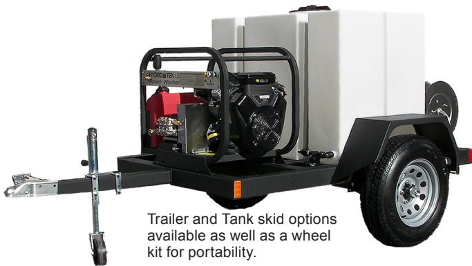
Trailer and Tank skid options available as well as a wheel kit for portability.

Hour meter, Hose reel, Downstream soap injection, Stainless or custom color frame, Wheel kit, Trailer and Tank skid