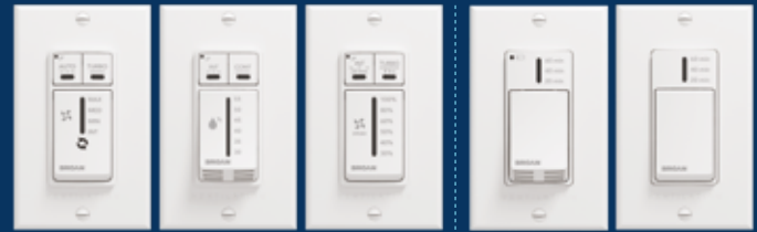
Automatic Control VAUTOW