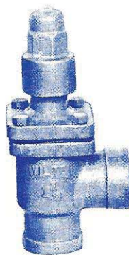
Valve Size: 1 1/4" — 2"